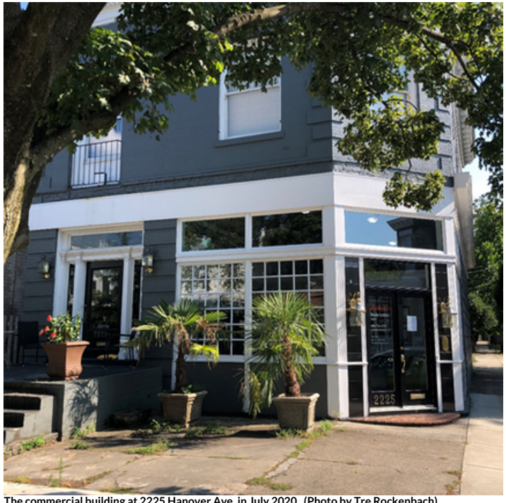
The commercial building at 2225 Hanover Ave. in July 2020.

Cross Hanover Avenue and continue walking west on Hanover Avenue for a half block to William F. Fox Elementary School, 2300 Hanover Ave.