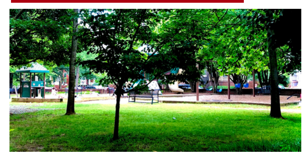
Lombardy & Park Avenue Triangle Park in July 2020.

The triangular green space created by the juncture of Lombardy Street and Park and Hanover avenues is a popular destination for families with children. Created in 1991, Lombardy & Park Avenue Triangle Park (often called Lombardy Park) is surrounded by a low brick wall, with wrought-iron gate access on each side. The park contains a large playground, a sandbox and benches. Each autumn, the park hosts a family pumpkin carving event. (Note: Dogs are not allowed inside this park.)