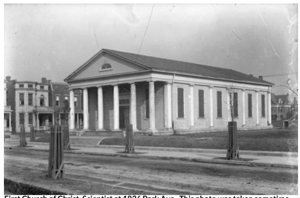
First Church of Christ, Scientist at 1836 Park Ave. This photo was taken sometime between 1907 and 1920.

As Richmond residents slowly moved west of the city into The Fan during the late 19th century, churches were established to serve the area's growing spiritual needs. The First Church of Christ, Scientist, located on the northeast corner of Park Avenue and Meadow Street, was built in 1907 in the Classical Revival style. In 1929, the congregation sold the building to the Society of Friends and moved to a new Classical Revival church at 2201 Monument Ave., where it remains active today.