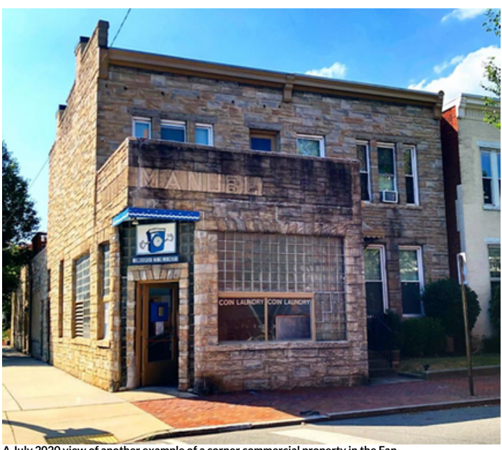
A July 2020 view of another example of a corner commercial property in the Fan 102 N. Lombardy St., built in 1893, which operates as a laundromat.