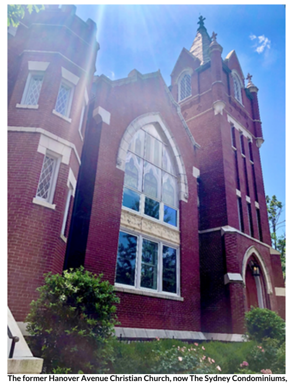
in July 2020.

Turn left and walk west on Hanover Avenue two blocks to the corner of Hanover Avenue and Meadow Street.