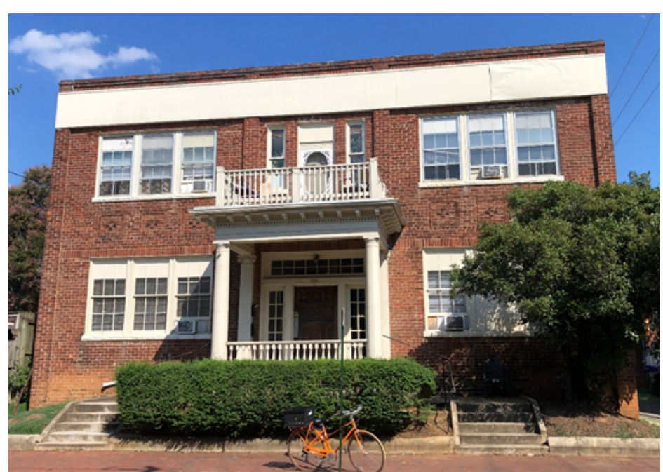
The Scott-Talcott School building, as it appeared in July 2020.

As more families moved into The Fan at the turn of the 20th century, both public and private schools were established for the benefit of area children. The building at 205 N. Lombardy St., which was constructed in 1905, originally housed the Scott-Talcott School, a private primary school for boys and girls. It has now been renovated into a multi-unit apartment building.