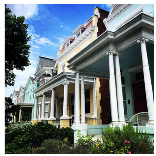
On the left, domed turrets in the 2100 Block of Hanover Avenue in June 2020. On the right, porches in the 2400 block of Grove Avenue in June 2020.

This tour will introduce you to some of Richmond's most colorful architecture, and give you a good sense of the city's history and growth – particularly with regards to parks, churches and schools – as residents moved westward from the central downtown area.