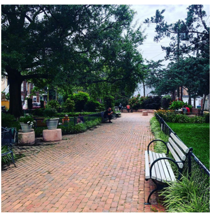
cuffletown Park in June 2020.

Continue walking east through the alley until it ends at Strawberry Street, then turn left. Walk north on Strawberry Street to the end of the block at Park Avenue, then turn right. Walk east on Park Avenue for three blocks to the corner of Park Avenue and Meadow Street.