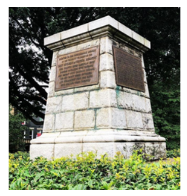
The First Regiment of Virginia Pedestal in Meadow Park on June 28, 2020.