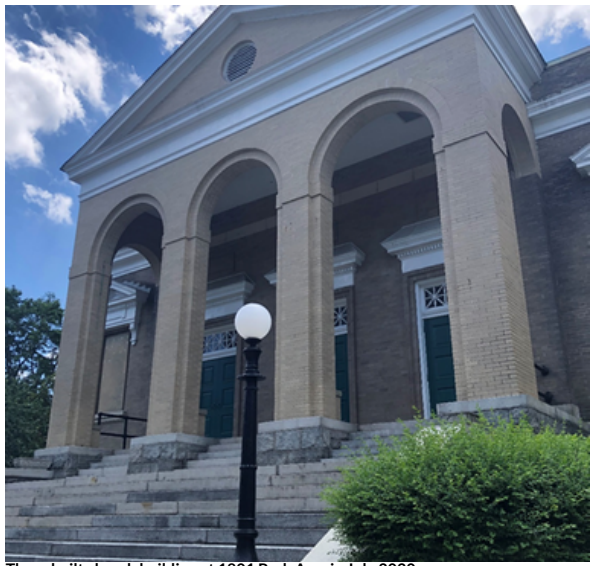
The rebuilt church building at 1801 Park Ave. in July 2020

In 1911, a Methodist congregation that previously worshipped a few blocks away erected a new church building on the southwest corner of Park and Allen avenues and named it Monument Methodist Church. The Greek Revival building featured a prominent temple-like portico and a domed sanctuary. The church was extensively damaged by a fire in 1950, and the congregation then merged with another group to create Reveille United Methodist Church on Cary Street Road. The church was rebuilt in 1952 and used by several other groups over the years, including Park Avenue Methodist Church and Community Church of God in Christ. As of July 2020, the building has been decommissioned as a church and is listed for sale.