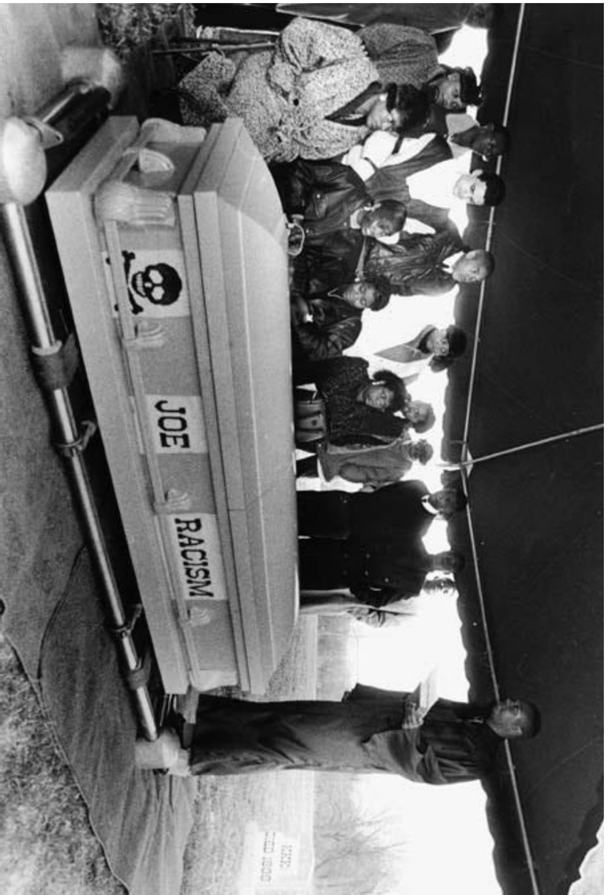
Funeral for "Joe Racism" at Armstrong High School, 1990